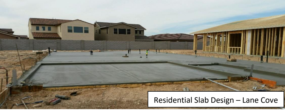
Residential Slab Design – Lane Cove