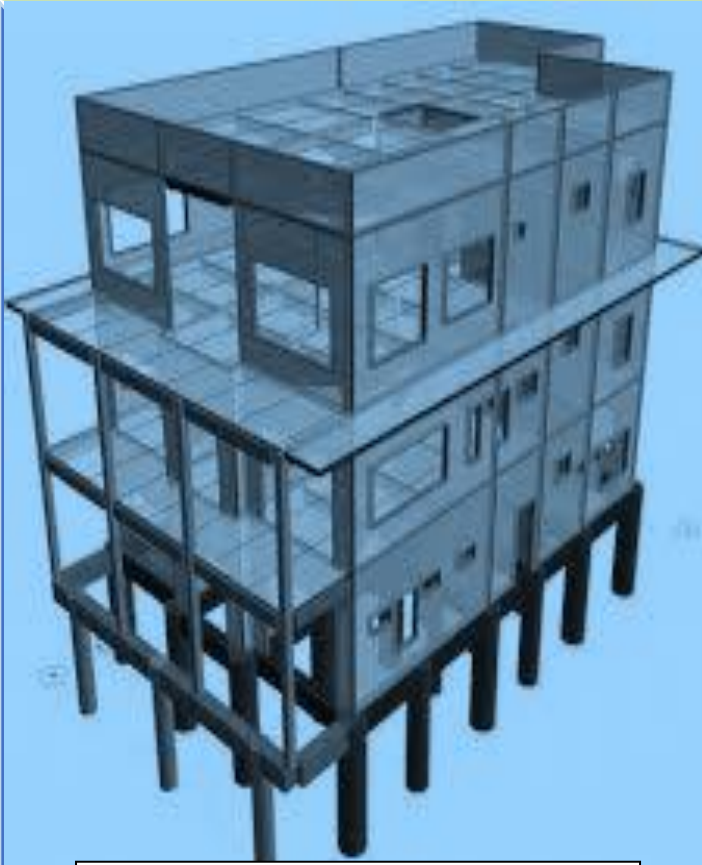
3 Storeys Residential building – Sydney